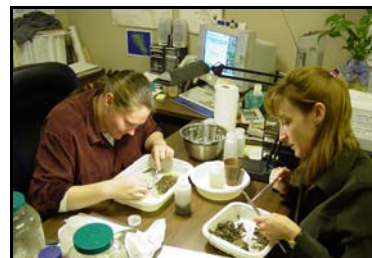
TRA CRP Staff sort benthic macroinvertebrates. Once sorted the bugs are sent to aquatic entomologists for counting and identification.

of the Trinity. Originally four sample runs were planned; one for each season. However rainfall during the summer sampling may have affected results, and therefore a second summer sample run is scheduled for July or August of 2003.