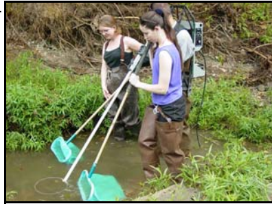
Electrofishing is a non-lethal means of capturing fish for identification

The highly developed nature of the upper Trinity watershed, primarily the Dallas-Fort Worth area, has historically meant that the river is highly impacted. Although the most severe pollution problems have been greatly re-