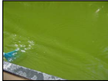
Excess nutrients can lead to algal blooms. The green color of the water pictured above is the result of an algal bloom that occurred in the headwaters of Ray Roberts during the spring of 2002.

dollars would be spent in an effort to clean up water bodies that might not have any problems. The Texas Commission on Environmental Quality has been working hard to come up with an alternative methodology that will result in more appropriate numeric criteria. In order to assist in this endeavor, the Trinity Basin CRP hired PBS&J to investigate the relationships between actual uses and nutrient concentrations. An oversight committee of Trinity Basin stakeholders was formed to provide direction. Nine